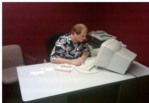
Service Coordinator Resource Center

The role of the Service Coordinator is to work with the individual survivor to assess needs and to collaborate and coordinate resources within the community on behalf of the client. The eight service coordinators are serving an average case load of fifty-four survivors and families. During FY15, the service coordinators collectively provided information on TBI to over 13,000 callers.