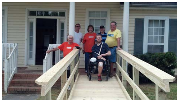
Service Coordinator secures grant for ramp

Case management: There are currently eight Service Coordinators assisting TBI survivors and their families in all 95 counties through contract arrangements with various non-profit agencies. Each agency has established a Family Support Center in their respective area for the purpose of providing service coordination for children and adults with TBI. These services include: providing information, referring consumers to appropriate services and agencies, assisting consumers in applying for and accessing services, advocacy, support group development and the development of new programs and activities.