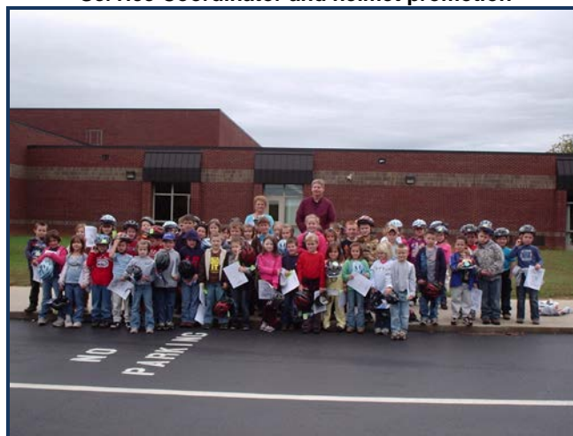
Service Coordinator and helmet promotion

The TBI Program collaborates with the Brain Injury Association of Tennessee to present an annual conference focusing on current topics including prevention and the need for early intervention. In addition, the TBI Service Coordinators provide prevention programs in their respective service areas. Project BRAIN, the HRSA funded grant project, is a program designed specifically to deal effectively with TBI students in the educational system.