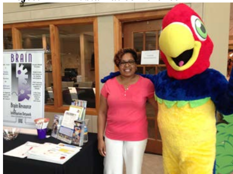
Project BRAIN staff at conference

Project BRAIN seeks to link hospital and community health providers with school professionals for identifying and addressing the needs of students with brain injuries. A specially designed TBI curriculum, Brain Injury 101 , is used to train educators, health professionals and families. Project BRAIN provides training in any school system in the state upon request.