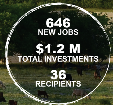
Agricultural Enterprise Fund