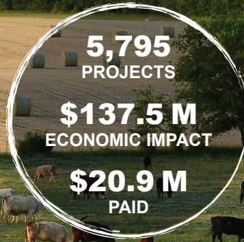
Tennessee Agricultural Enhancement Program