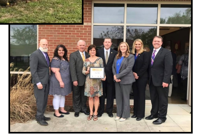
Johnson City NCVRW