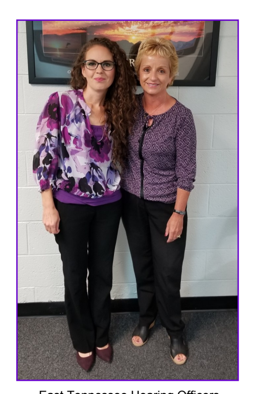
East Tennessee Hearing Officers Greeneville and Johnson City Offices