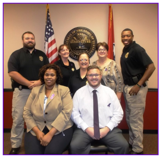
TDOC D60 Jackson Office Staff