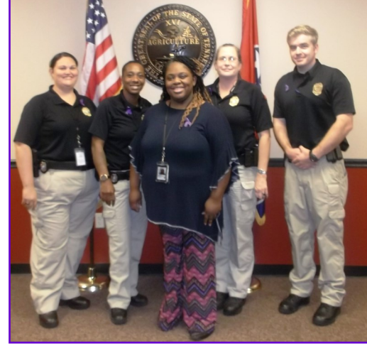
TDOC D60 Jackson Office Staff