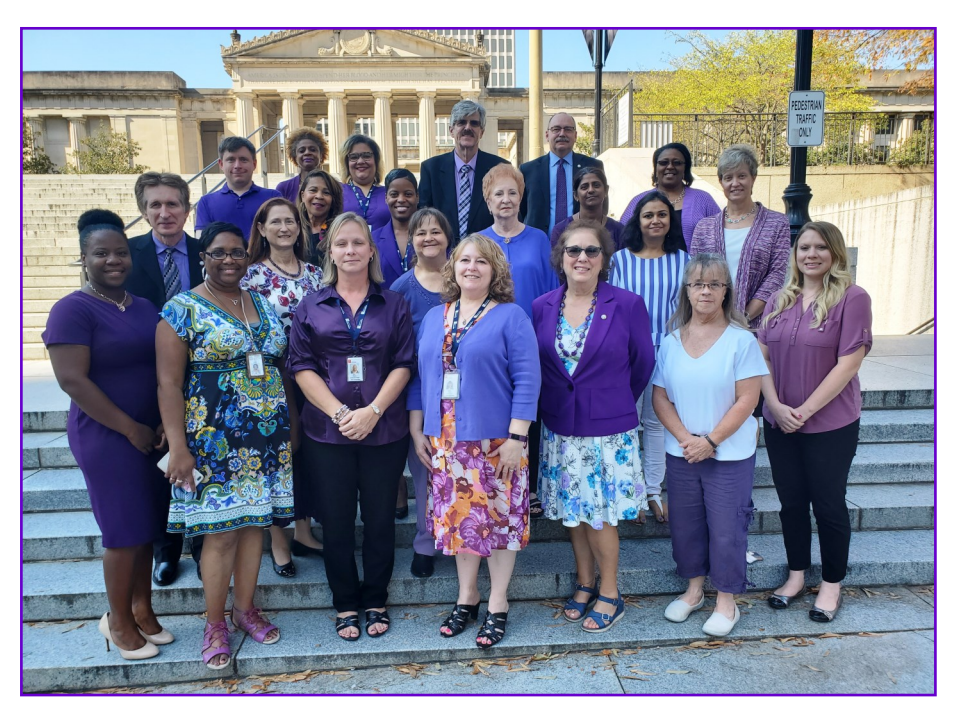
TDOC Nashville Central Office Staff