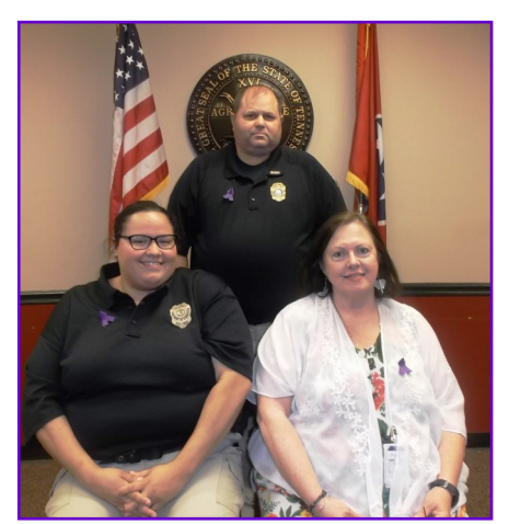
Mourn Celebrate Connect