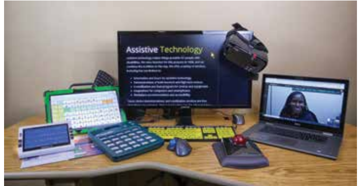
A display shows some of the technology the STAR Center can provide to help people meet their goals, even during a pandemic.

With our new ways of service, lives continue to be changed. The nurse with hearing loss was able to keep treating patients using a stethoscope with a wireless connection to her hearing aids. A teenager with difficulty talking learned to socialize using her communication device and smartphone. The music producer with vision loss received updated technology as he moved to work from home. A college student studying sign language