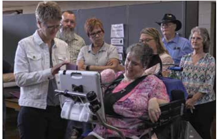
Technology innovations allow people with limited movement and speech to drive wheelchairs with eye movements and communicate with family, friends, and staff.