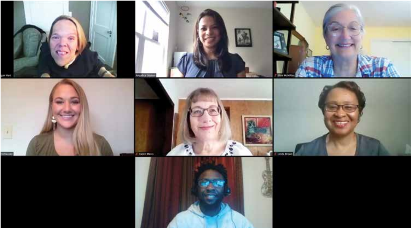
In a world of remote meetings, Disability Pathfinder's staff continues the work to help Tennesseans find resources for people with disabilities.

As the practices of masking, social isolation, and self-quarantine stretched further and further into the future, we witnessed quickly increasing numbers of people looking for financial help. They needed new ways to cover essential needs. Our Multicultural Program broadened into areas where there was no one else to help. We helped with interpretation, and when individuals and families met the requirements, helped