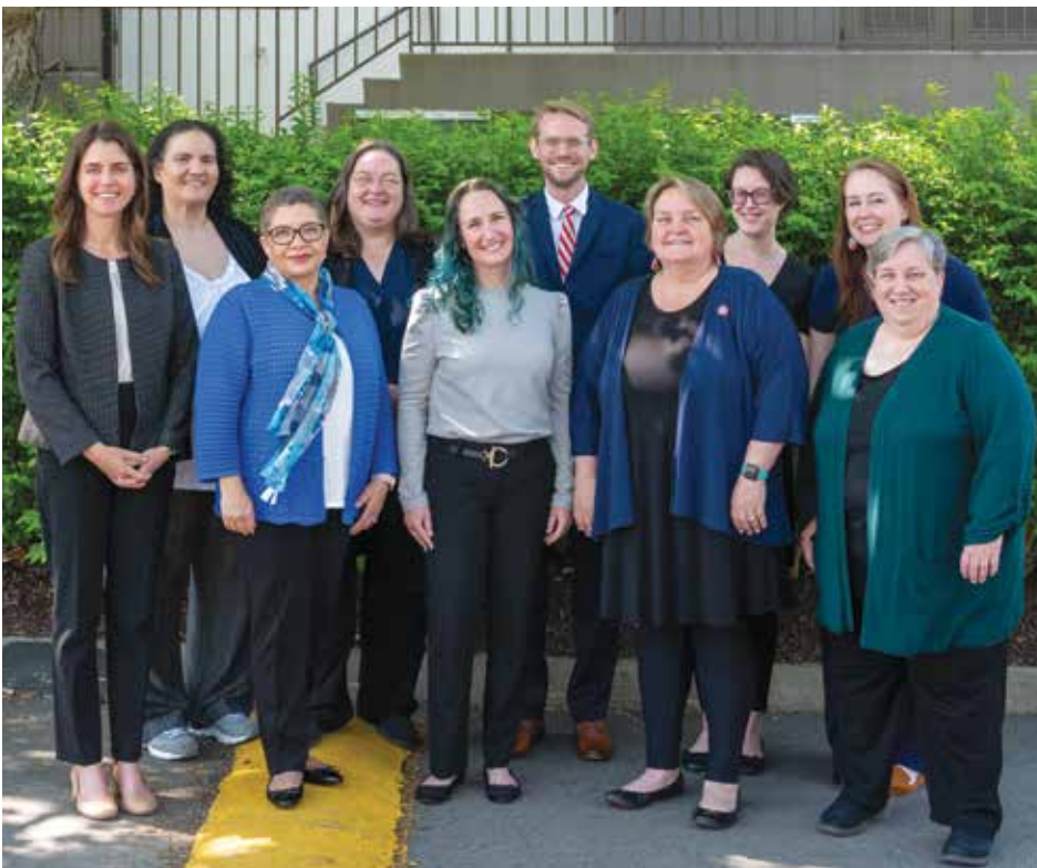
Find contact information for any member of our team at tn.gov/CDD .

The proof of a strong team is in our results. We invite you to get to know us. Follow along with us to see change in progress. And most importantly, join us. As amazing as our team is, we know this work is bigger than us. It will take our entire community working together to build the future we want for people with disabilities in Tennessee. ■