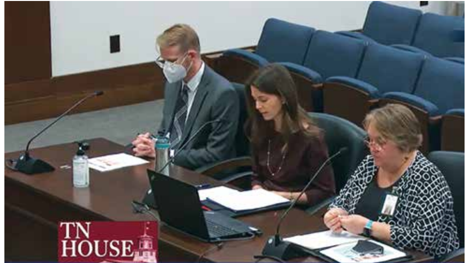
FINANCE, WAYS & MEANS COMMITTEE

What is your favorite way to spend a day off? Walking on Tennessee trails. We are fortunate to have so many state parks and natural areas, and I'm always looking for new ones to explore.