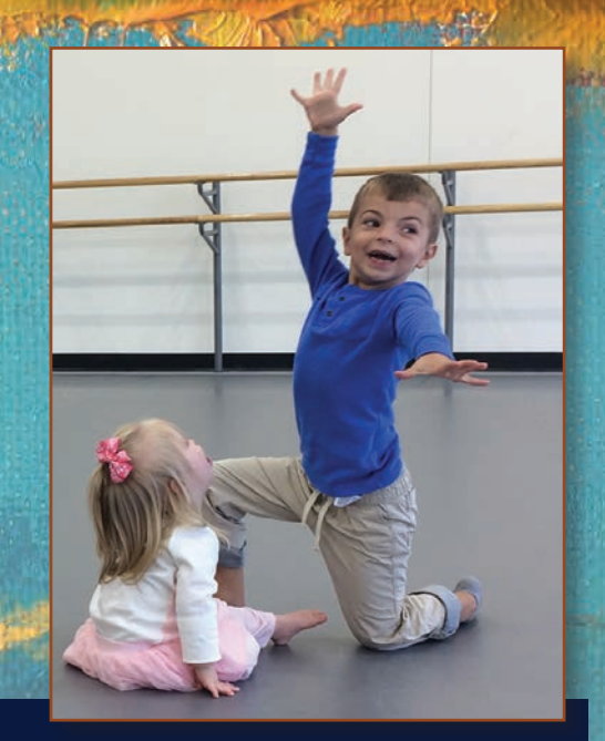
Dance Is a Universal Language Page 5