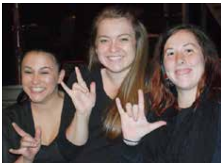
Interpreters at Deaf Night at the Theatre