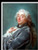
Gustaf Lundberg Portrait of François Boucher 1741 Oil on canvas Musée du Louvre, Paris

This portrait portrays Madame de Pompadour, mistress and confidante of Louis XV, as she wants to be seen: a symbol of music, literature, the fine arts, and politics. It is a part of the femme d'esprit, which means women of culture and learning. Her elegant blue silk dress adorned with roses, ruffles, and ribbons shows her femininity and good taste.