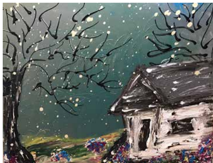
Spring Snow by Tracy Bettencourt