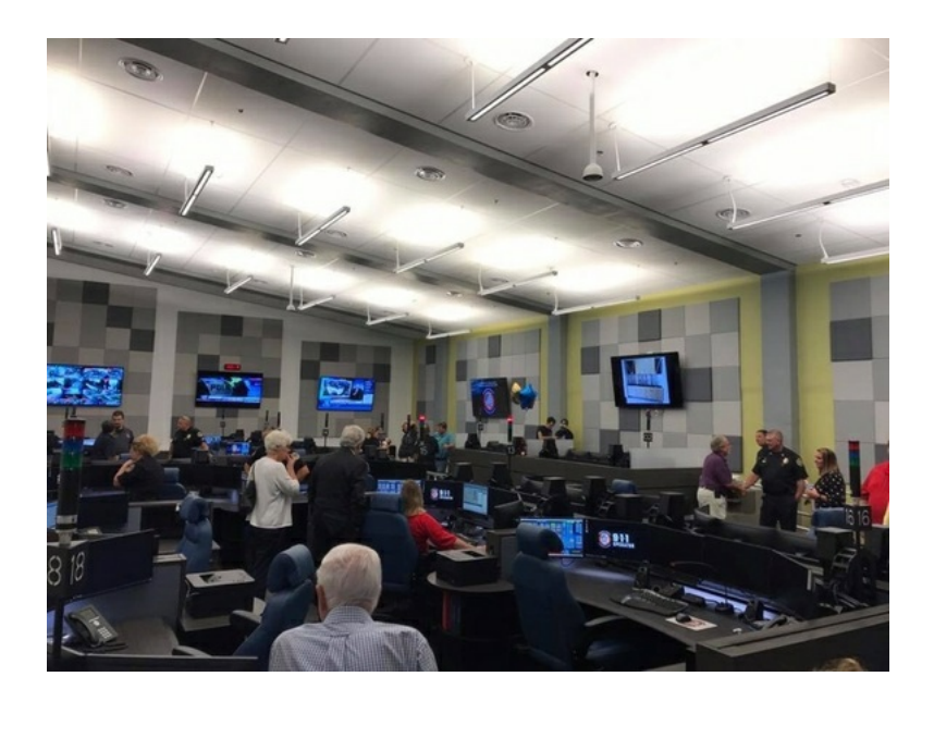
Inside the New Sumner County PSAP

A: This consolidation was a long drawn out process that we started back in 2008. It was not an easy task and was not something that we just jumped into. We looked at the feasibility of it and after deciding to move forward with the blessing of all that would be affected by it, we tried to plan for everything. We also visited several sites that had already done this to get their thoughts and find out what issues or obstacles they had to overcome. By doing this I believe that it made our transition a smoother one. We still have a way to go with getting all the Telecommunicators crossed trained and getting their times up to where they were, but we are well on our way and welcome anyone that would like to come and tour the center or discuss our process.