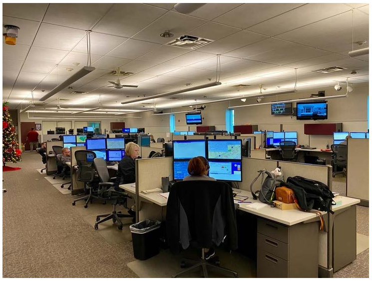
The first, first responders taking emergency calls at Knox County 911.