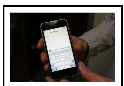
Director Sutton's phone used to send first test text to 9-1-1.