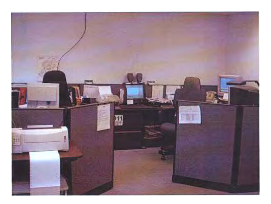
View of Dispatch Room