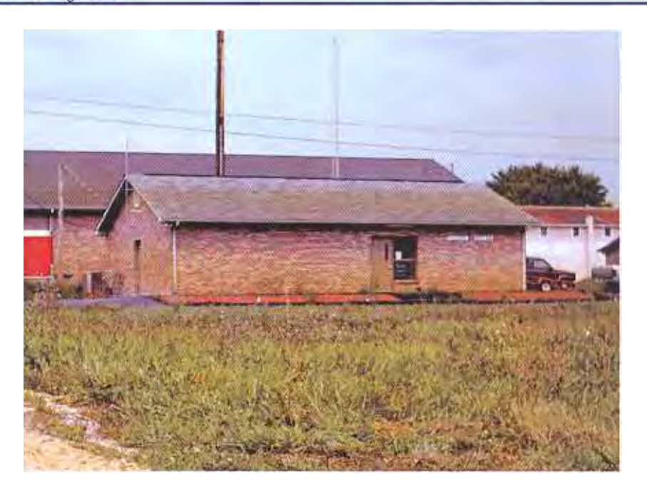
Former JCECD Building