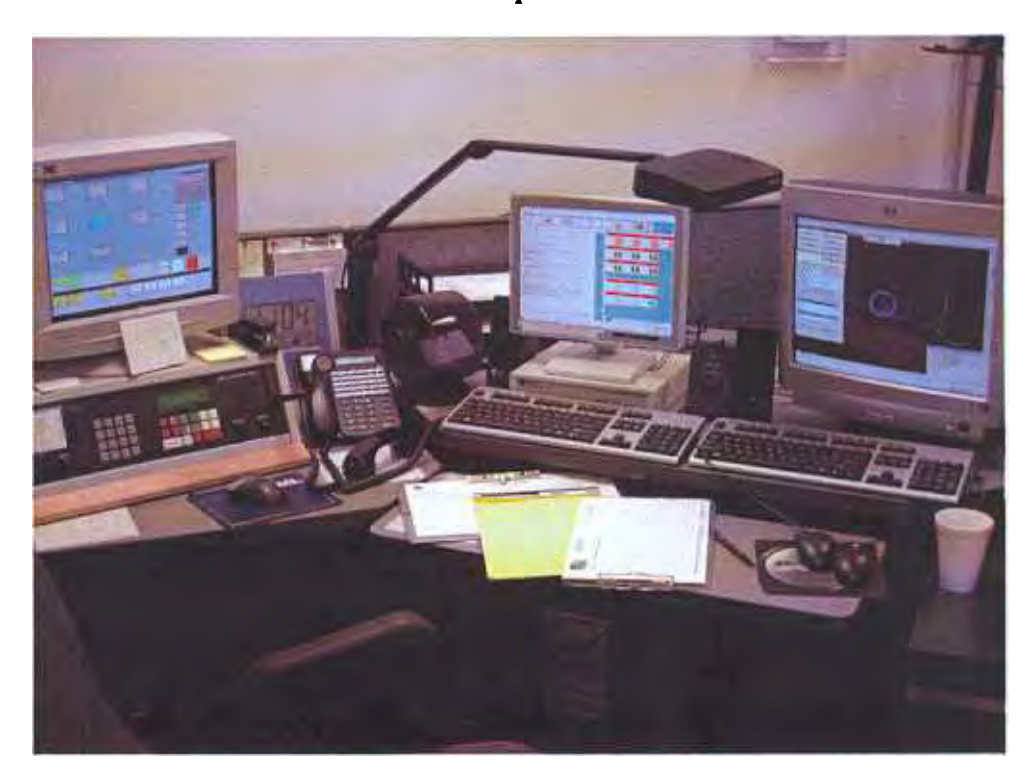
Console Layout (1 to r) - Radio, CPE, Map Display