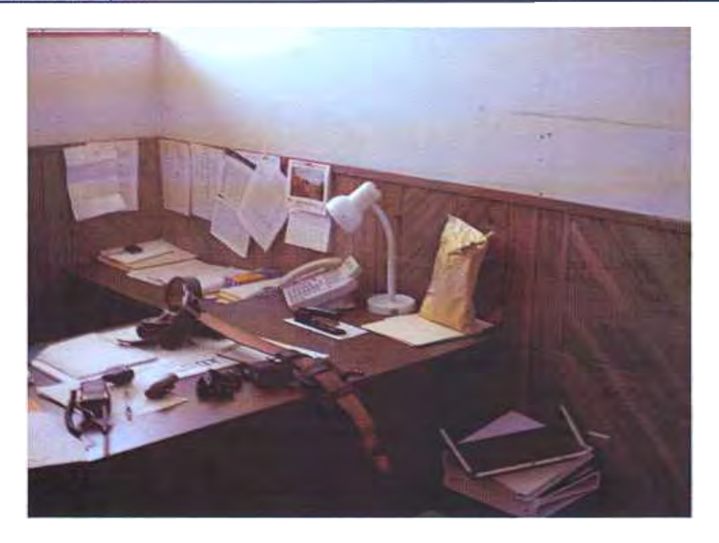
View of Space Where Dispatch Center Could Be Deployed - 3