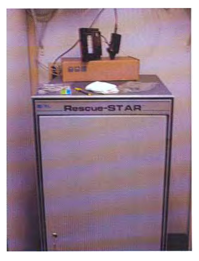
CML Rescue Star 9-1-1 Backroom Electronics