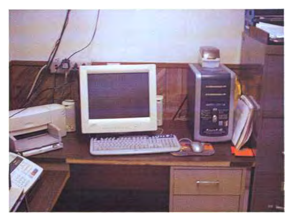
View of Space Where Dispatch Center Could Be Deployed - 2