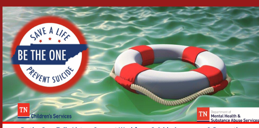
Be the One: Talk, Listen, Connect Workforce Suicide Awareness & Prevention Webinar Announcement

-Never take or administer medication from a lamaged container, or you cannot read the label.