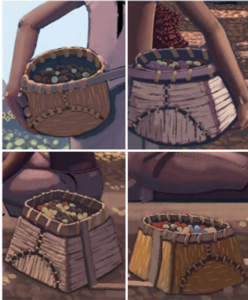
Food that children gathered