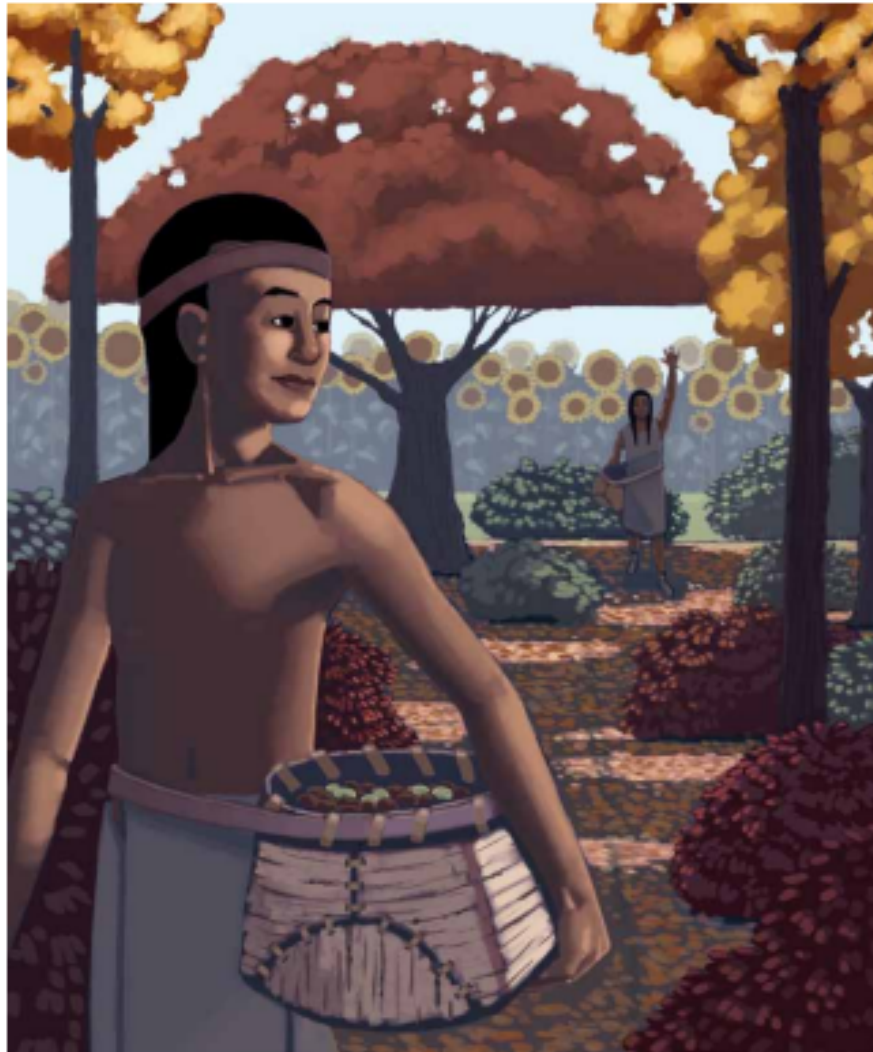
Aponi calls to Akando to wait.