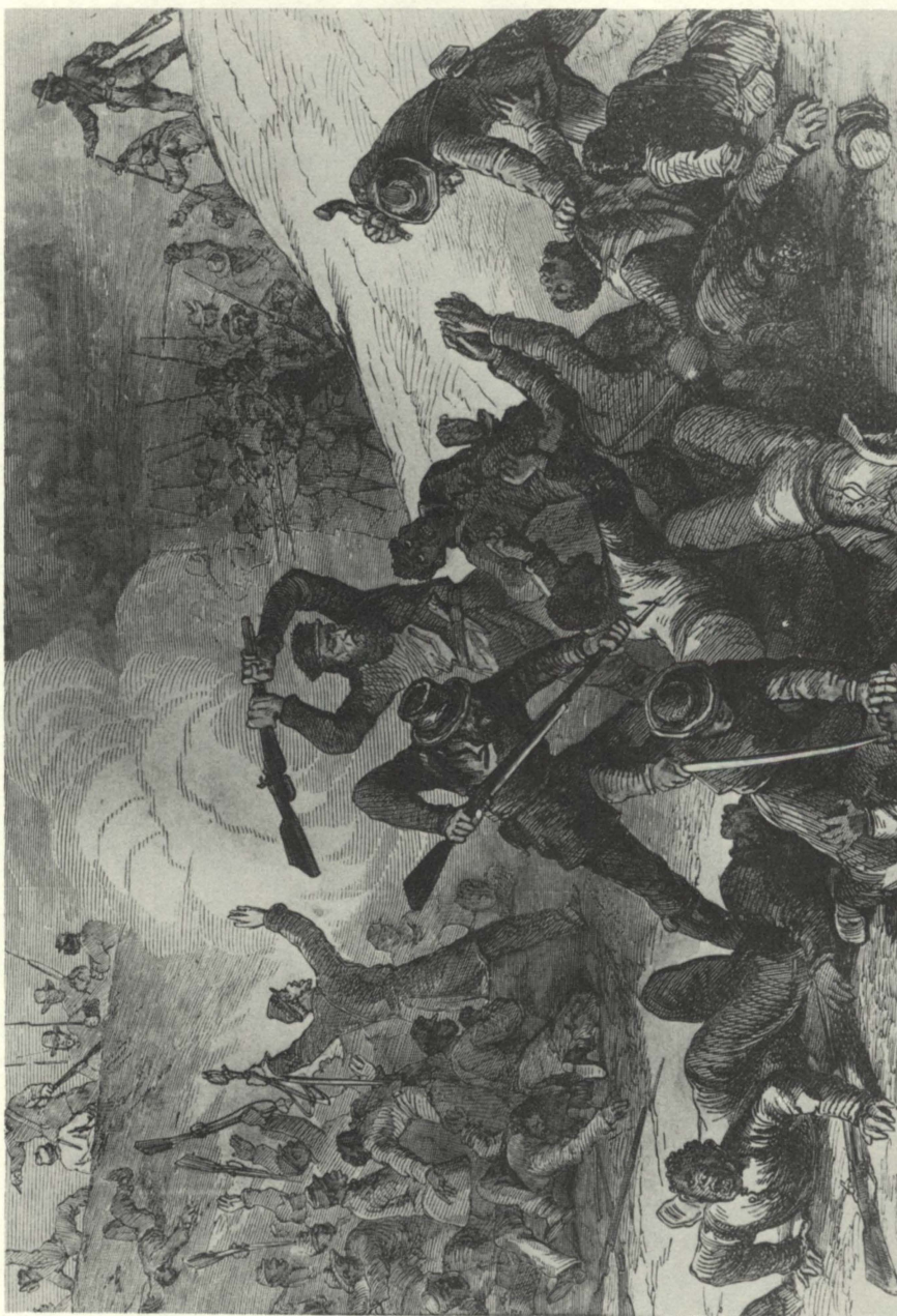
Frank Leslie's Illustrated Newspaper