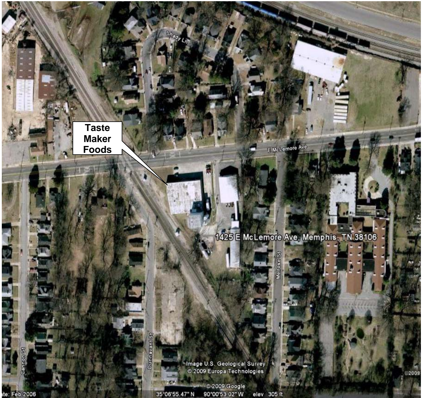
FIGURE 1. Location of the ISS Oxford Building Services at 1415/1425 East McLemore Ave in Memphis, Shelby County, TN, occupied by Taste Maker Foods. Figure Credit: Google Earth 2009