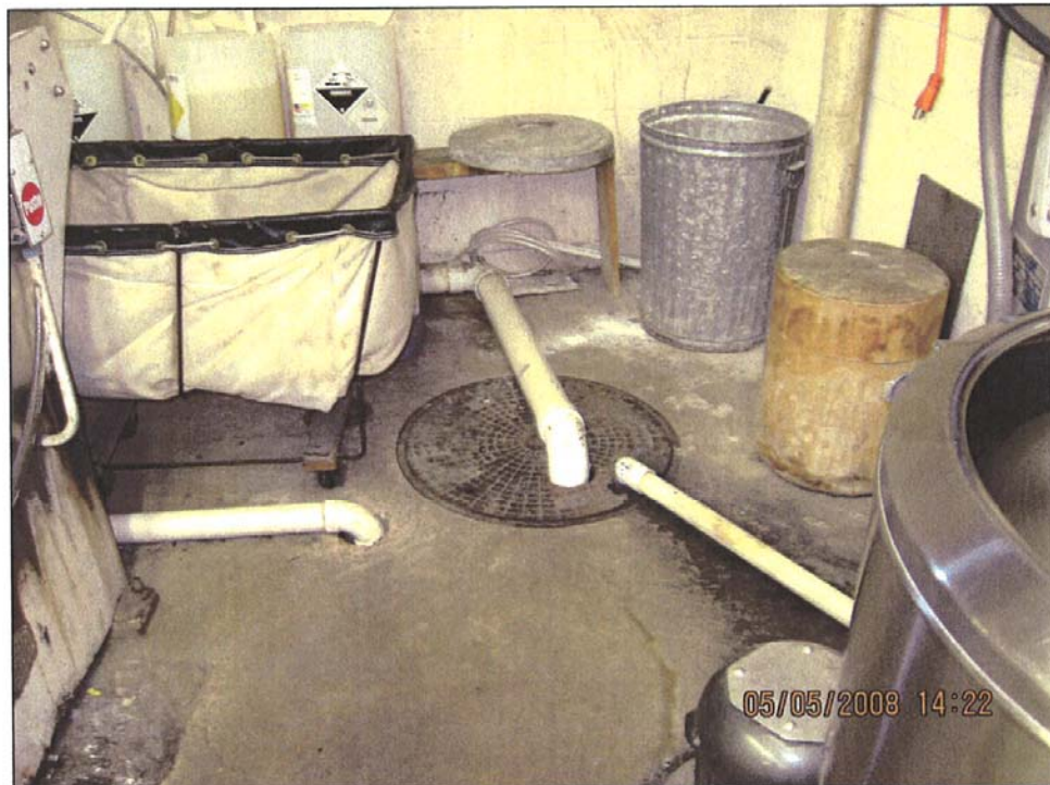
Photo 6: View of drainage area near the equipment in the northwest corner of the facility.