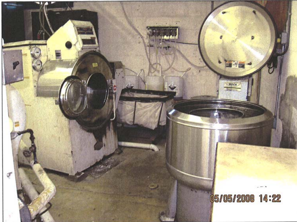
Photo 5: Typical view of the equipment located in the northwest corner of the facility.