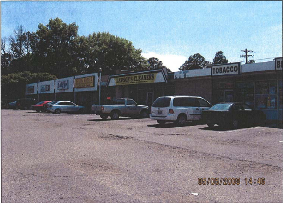
Photo 1: View of Lawson's Cleaners from the parking lot on the east side of the property.