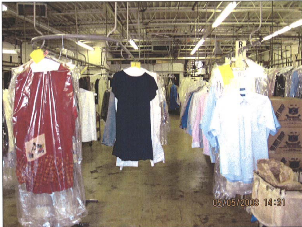
Photo 3: Typical view of the clothes hanging area in the center of the building.