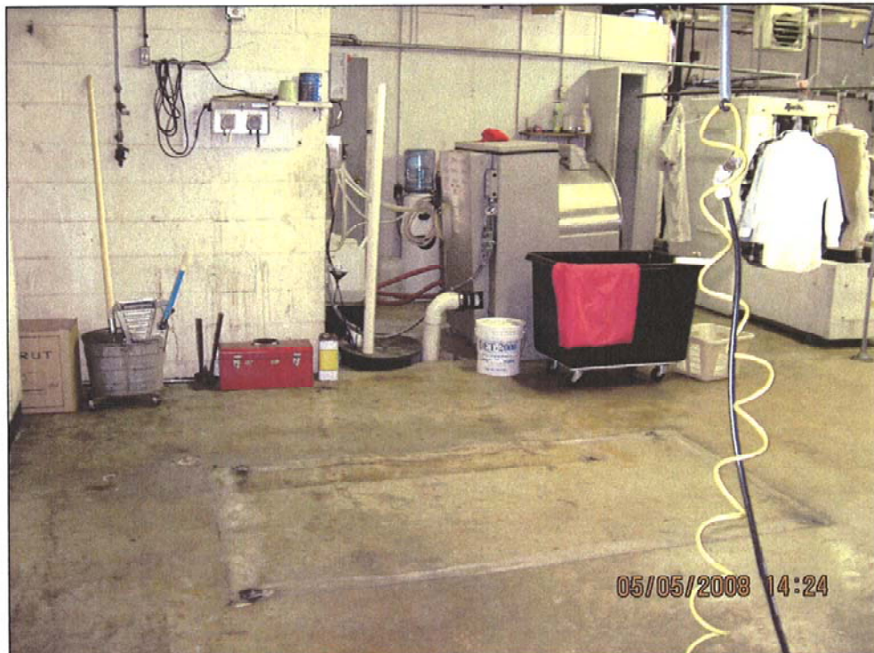
Photo 4: View of the footprint of the drycleaning machine formerly located on the property.