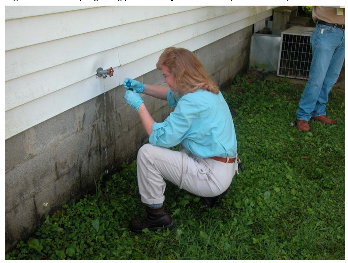
Figure 2. Well sampling being performed by Tennessee Department of Superfund Staff