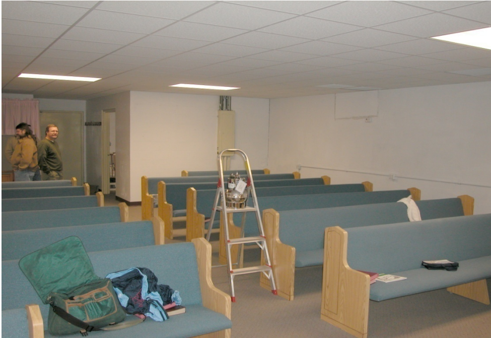
Figure 2. Photo of a Summa Canister set up to collect air data within the small nursery where the most sensitive population would be present for short periods of time. (photo: dmb 10/27/05)

Figure 1. Photo of the inside of the Former Fashion Cleaners after it was converted to a church. Note the electrical panel near which the dry cleaning machine would have been in operation. Also note the open doorway to the small nursery room (former boiler room). A Summa canister was used to collect an air sample at the breathing height of church-goers. (photo: dmb 10/27/05)