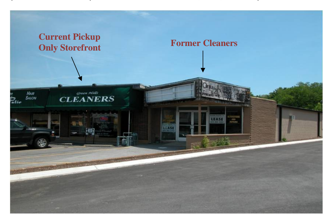
FIGURE 2 - View of retail establishments at the northern end of the shopping center, near the former cleaner location.