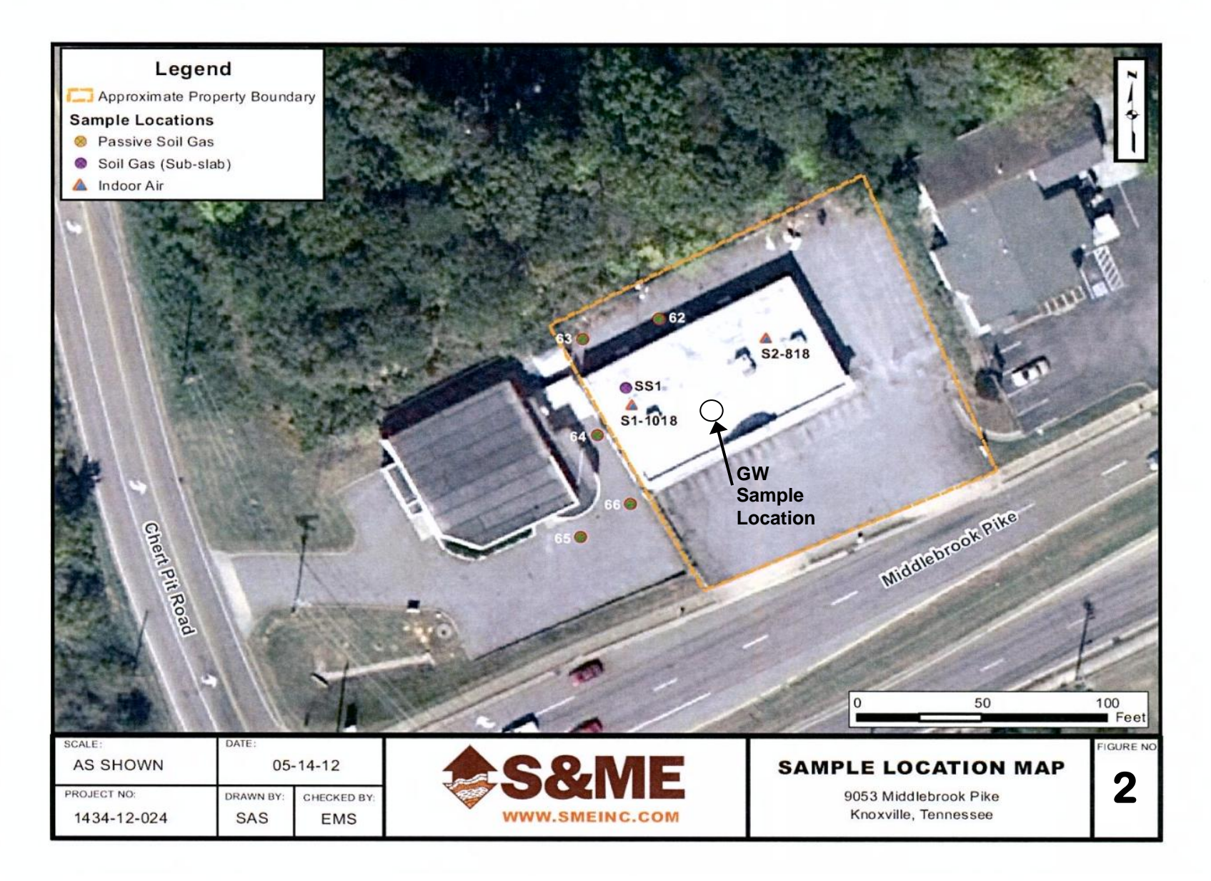
Figure 2. 9053 Middlebrook Pike Site passive soil-gas, sub-slab soil-gas, indoor air, and groundwater sampling locations (S&ME 2012).