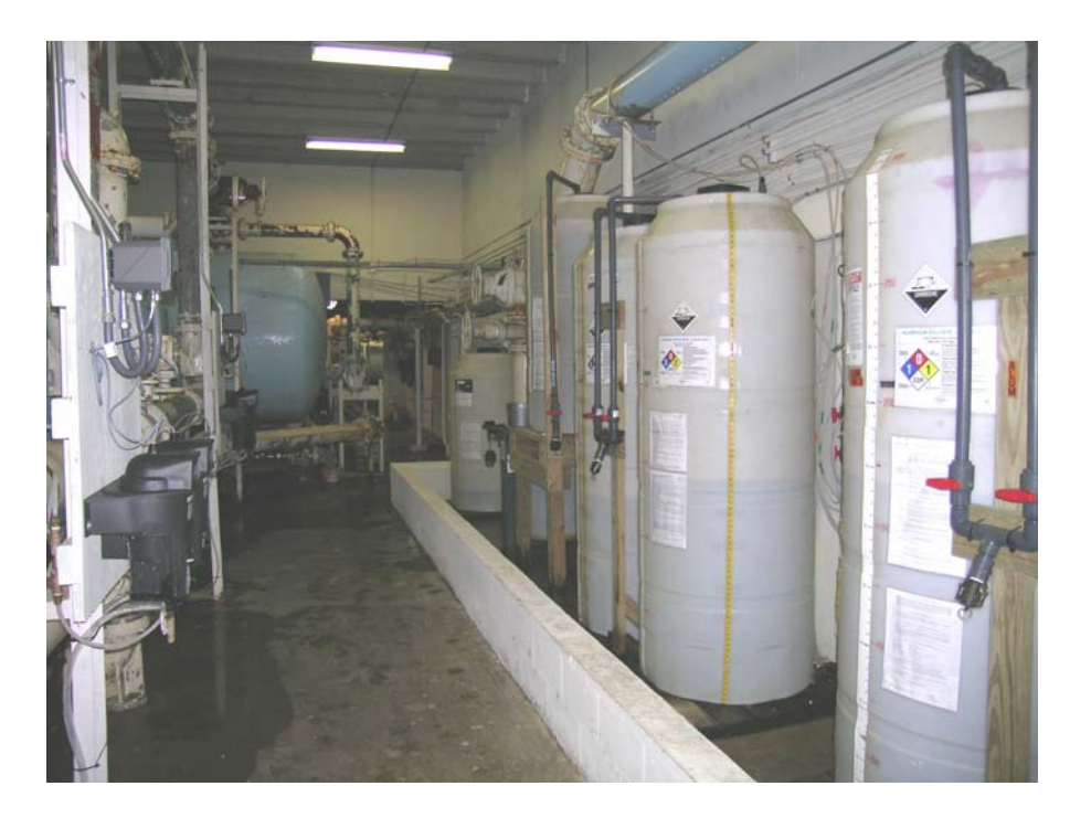
FIGURE 3 - Photo of the well building at the WRUD water treatment facility. The tetrachloroethylene spill occurred on the property beyond fence; approximately 100 yards from the well building. Hamilton County, Tennessee.