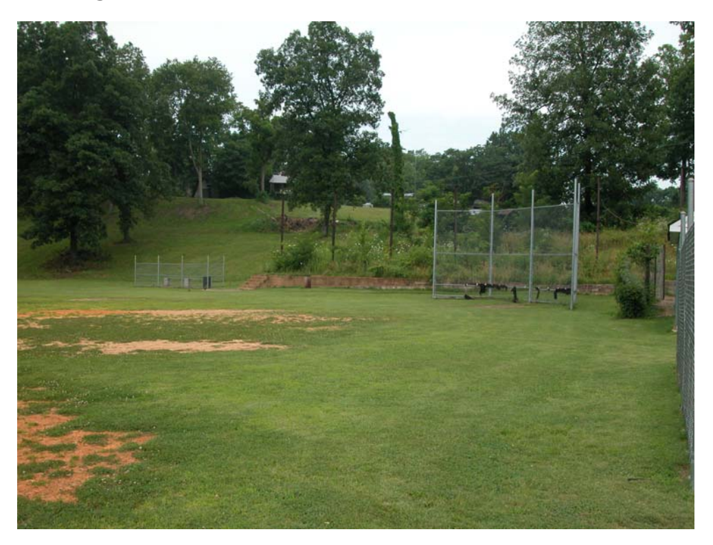
Figure 1. Athletic Field (a/k/a Old Ball Field).