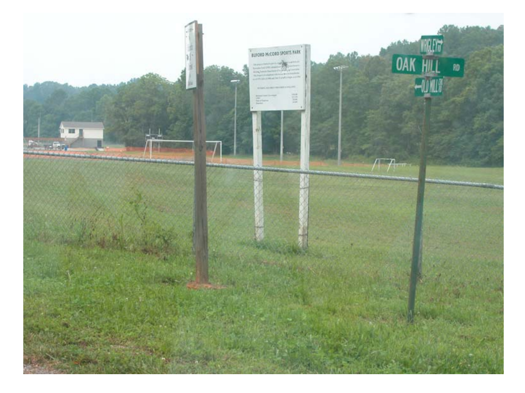
Figure 2. Buford McCord Sports Park.