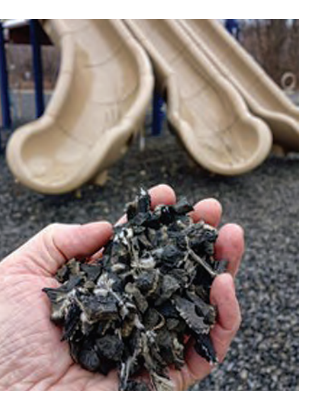
Crumb rubber can contain lead and other heavy metals.

Participants also agreed that a strong, unified communications campaign directed at diverse audiences will be necessary. A campaign will require targeting audiences, developing sophisticated messages, and employing a range of media, from public service announcements on radio and television to print ads to social media campaigns. Crafting clear, mainstream language that includes solutions-focused approaches will be critical, using the time-honored test of Will it play in Peoria? —that is, in everytown ? We also need to communicate with state and local funders so they can understand and support efforts to eliminate lead.