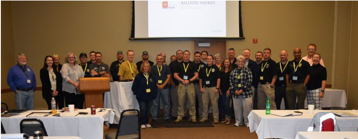
“Bridging the Gap: Child Deaths and Gunshot-Related Deaths; A Team Approach to Death Investigation” Montgomery Bell State Park, May 2019

The OSCME and MTSU Fire wrapped up the 2018-2019 Justice Assistance Grant Cycle at Montgomery Bell State Park in May, 2019. Thank you to all who lectured and attended the six JAG trainings held in the Fall of 2018 and Spring of 2019. We are in the process of developing the new class for the 2019-2020 cycle. Watch your email for information on dates, locations and links to registration.