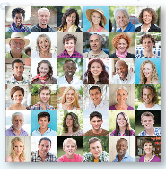
An estimated 405 million people in 60 countries worldwide enjoy the benefits of fluoridated water.

Water fluoridation provides dental benefits to people of all ages and income groups without requiring them to spend extra money or change their daily routine.