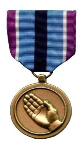
Figure 5.3. HSM.

5.2.3.1. The HSM is awarded to Air Force members, including Reserve components, who, after 1 April 1979, distinguished themselves by meritorious direct participation in a significant military act or operation approved for award by the DoD.