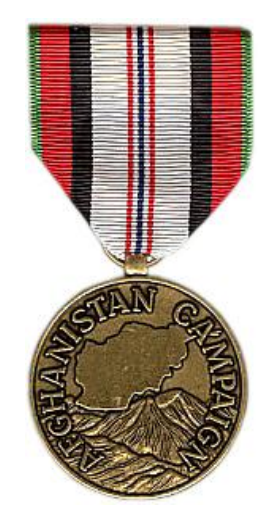
Figure 6.16. ACM.

6.17.1. Established by Public Law 108-234, dated 28 May 2004, and Executive Order 13363, dated 29 November 2004, the ACM recognizes service members who serve or have served in the country of Afghanistan in support of OEF. The area of eligibility encompasses