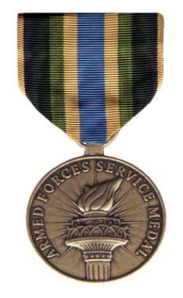
Figure 5.2. AFSM.

5.2.2.1. Established on 11 January 1996, the Armed Forces Service Medal recognizes members of the Armed Forces of the United States who, after 1 June 1992: