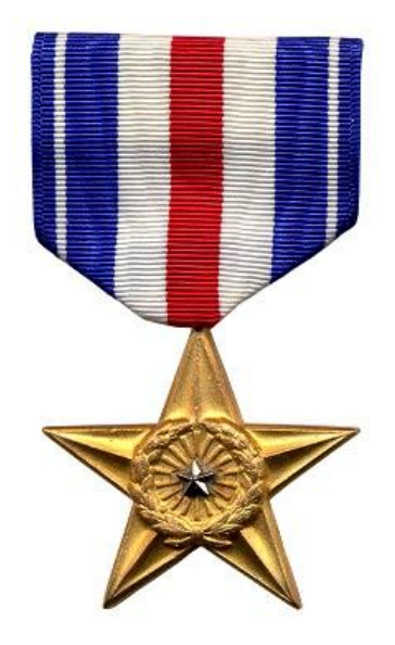
Figure 3.4. Silver Star (SS).