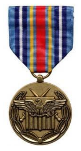
Figure 6.18. GWOT-E.

6.19.1. Established by Executive Order 13289, 12 March 2003, to recognize members of the Armed Forces of the United States who deployed abroad for service in the Global War on