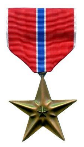
Figure 3.8. Bronze Star Medal (BSM).

3. Members of the Armed Forces of the United States who were awarded the Combat Infantryman Badge or Medical Badge for exemplary conduct in ground combat against an armed enemy between 7 December 1941 to 2 September 1945 may apply by letter to the Department of the Army for award of the BSM. A copy of the general order announcing the award of either badge should be attached to the application letter, with a statement as to whether approval of the BSM would duplicate any previous award for the same period of service. If general orders are not available, the specific authority for the award of the badge must be included in the application letter, or attached.