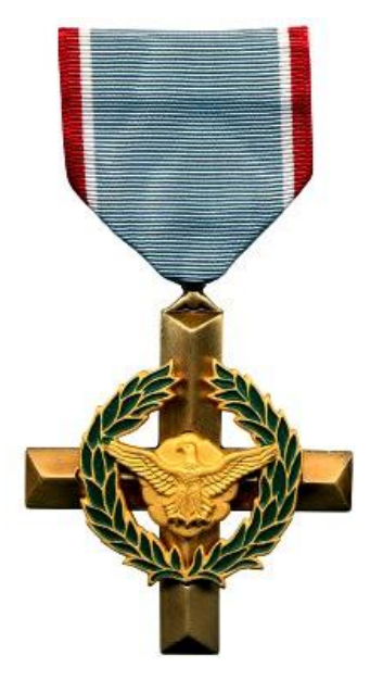
Figure 3.2. Air Force Cross (AFC).