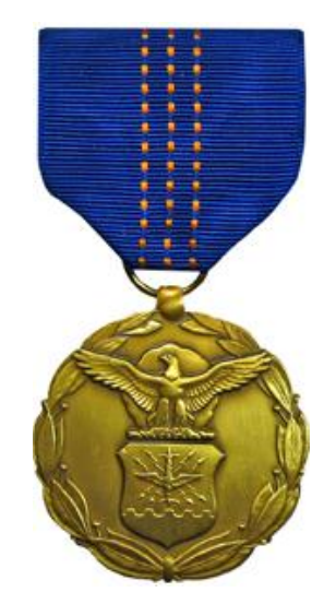
Figure 8.1. ESA.

8.3. Air Force Scroll of Appreciation (AFSA). The Air Force Scroll of Appreciation consists of a certificate awarded by the DAF for meritorious achievement or service to US or foreign civilians, groups, or organizations, not employed by the US government. It may also be awarded to recognize acts of courage that do not meet the risk of life requirements for award of the ESA. Prior to presentation, commanders shall mat the AFSA and place it in a frame with a glass cover. The color of the matting, type and size of the frame are at the discretion and expense of the nominating commander and may be paid for using the organization's international merchant purchasing authorization card (i.e., IMPAC).