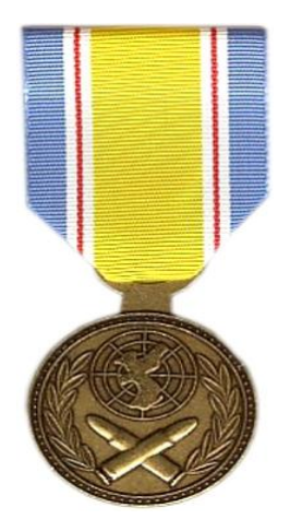
Figure 7.13. ROKWSM.

7.4.10.1. The SECDEF approved the acceptance and wear of the Republic of Korea War Service Medal on 20 August 1999, to recognize the sacrifices of US veterans of the Korean War. To receive this medal, military veterans must have served in the country of Korea, its territorial waters, or airspace within the inclusive period of 25 June 1950 to 27 July 1953. Service must have been performed while on permanent assignment in Korea, or while on temporary duty in Korea for 30 consecutive days or 60 nonconsecutive days, or while as a crewmember of aircraft in aerial flight over Korea participating in actual combat operations, or in support of combat operation