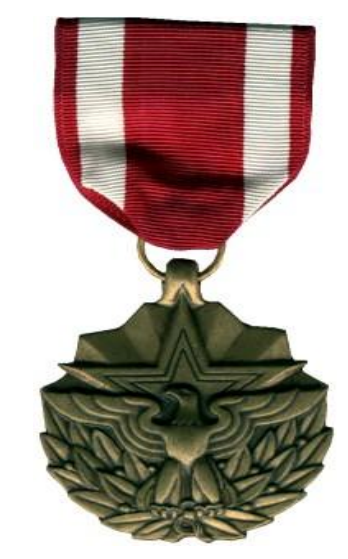
Figure 3.10. Meritorious Service Medal (MSM).