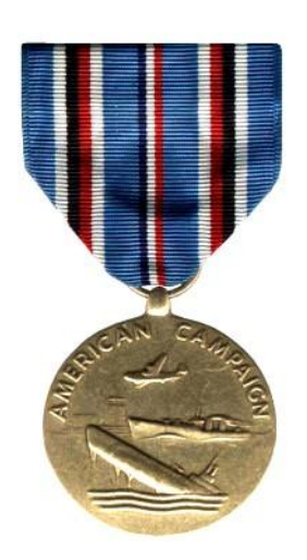
Figure 6.3. ANCM.

6.4.1. The American Campaign Medal was established by Executive Order 9265, and announced in War Department Bulletin 56, 1942, and amended by Executive Order 9706, 15 March 1946. It is awarded for service within the American Theater between 7 December 1941 and 2 March 1946 under any of the following conditions: