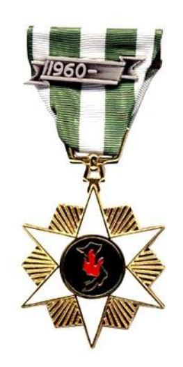
Figure 7.10. RVNCM.

7.4.7.1. The Republic of Vietnam Campaign Medal is awarded to members of the Armed Forces of the United States who between 1 March 1961 and 28 March 1973 who: