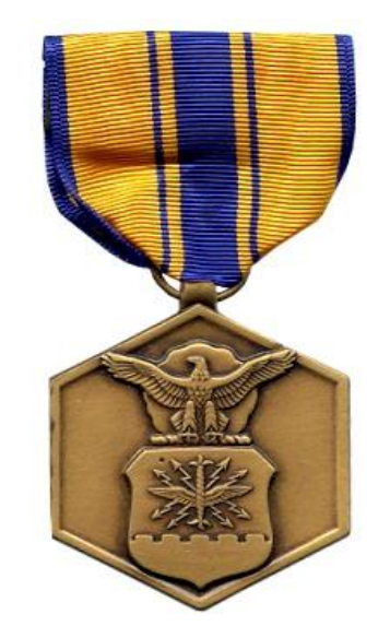
Figure 3.13. Air Force Commendation Medal (AFCM).