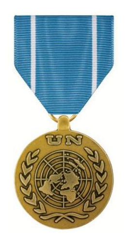
Figure 7.9. UN Medal.

7.4.5.1. The medal is authorized by the Secretary General of the UN for specific UN missions and actions. Executive Order 11139 authorizes SECDEF to approve acceptance