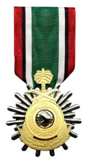
Figure 7.11. KLM-SA.

7.4.8.1. The Kuwait Liberation Medal-Saudi Arabia was authorized by the Government of Saudi Arabia to members of the Coalition Forces who participated in Operation DESERT STORM and the liberation of Kuwait. The Deputy Secretary of Defense authorized the acceptance and wearing of the KLM-SA by members of the Armed Forces of the United States.