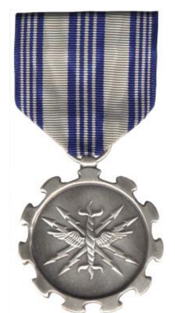
Figure 3.14. Air Force Achievement Medal (AFAM).