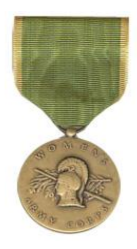
Figure 6.2. WACSM.

6.3.1. The Women's Army Corps Service Medal was established by Executive Order 9365 and promulgated in War Department Bulletin 17, 1943.