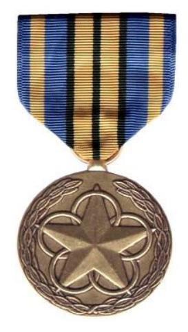
Figure 5.4. MOVSM.

5.2.4.1. The Military Outstanding Volunteer Service Medal (MOVSM) was established on 9 January 1993 to recognize members of the Armed Forces of the United States and their Reserve components who, subsequent to 31 December 1992, perform outstanding volunteer community service of a sustained, direct, and consequential nature.