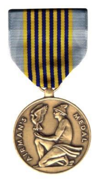
Figure 3.7. Airman's Medal (AmnM).