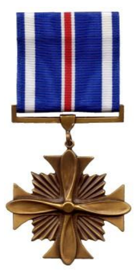
Figure 3.6. Distinguished Flying Cross (DFC).

3. The most appropriate achievement or service award for a foreign general or flag office is the LOM of appropriate degree. Forward DFC recommendations for foreign general or flag officers as a request for an exception to policy through the chain of command to SAFPC.