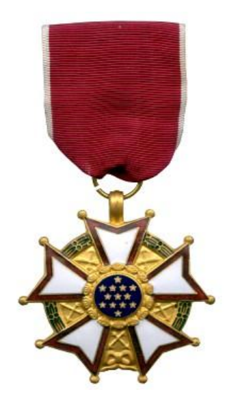
Table 3.6. Distinguished Flying Cross (DFC) (see notes).