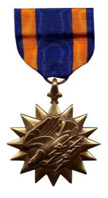
Table 3.12. AERIAL ACHIEVEMENT MEDAL (AAM).