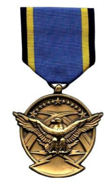
Table 3.13. AIR FORCE COMMENDATION MEDAL (AFCM) (see notes).

Figure 3.12. Aerial Achievement Medal (AAM).