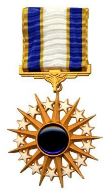
Table 3.4.Silver Star (SS).