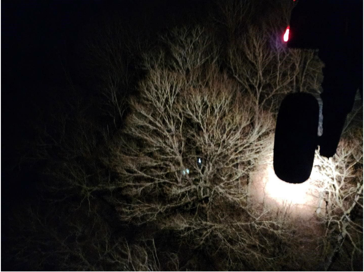
A Tennessee Army National Guard Blackhawk helicopter locates the fire and strobe light signals set by park rangers with the Great Smoky Mountain National Park during the rescue of a hiker near the Silers Bald Shelter along the Appalachian Trail in the early morning of April 5.