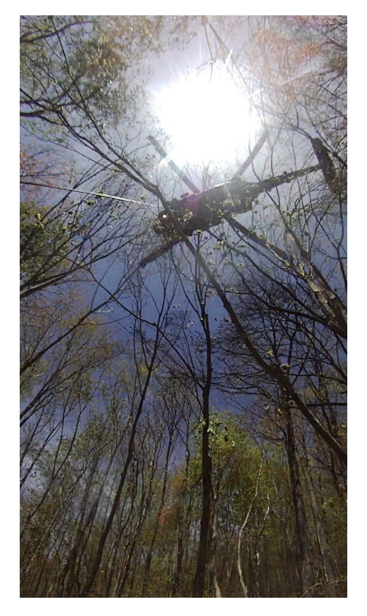
A Tennessee Army National Guard Blackhawk helicopter locates a distressed hunter in the Cherokee National Forest at approximately 2 p.m., May 4. (Submitted photo)