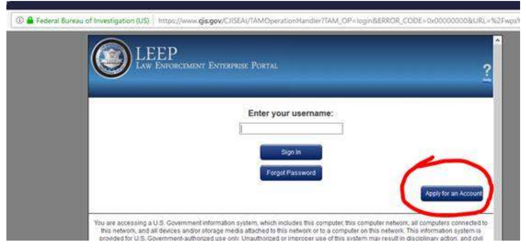
STEP 1: Apply for a LEEP account at <a href="https://www.cjis.gov">www.cjis.gov</a> .

Investigators and intelligence analysts should take advantage of the FBI's free searchable database N-DEx (National Data Exchange). If you are wanting access to N-DEx, you must get a LEEP account first. Go to <a href="www.cjis.gov">www.cjis.gov</a>. You will see on the homepage "Apply for an Account." After a short background check, you'll receive an e-mail with you login info. You will then log-in to LEEP with your new account. Once you are in you will have access to several resources, but you must request N-DEx access. You will see two windows pop-up, and you must agree to the N-DEx access agreement. The training modules are no longer required. If you have any questions or interested in the April 2<sup>nd</sup> class at the TBI, you can contact Zack Frisbee at <a href="mailto:Zack.Frisbee@tn.gov">Zack.Frisbee@tn.gov</a>.