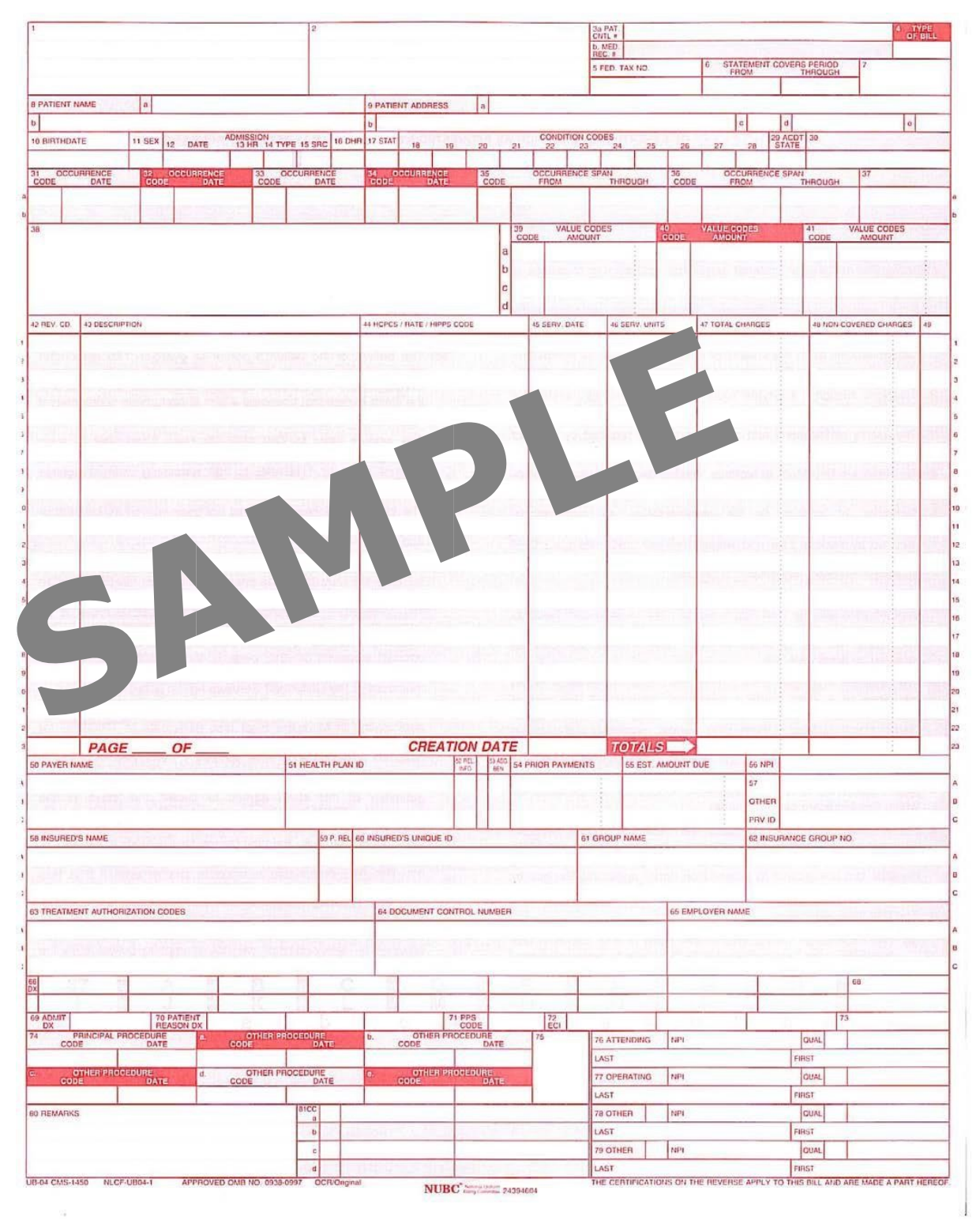
Figure B.1: UB-04 Claim Form