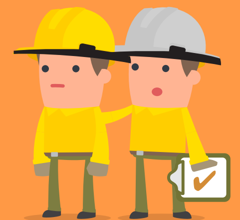
Crew Safety Briefing