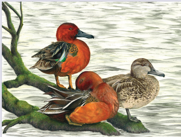
Mary Alford's depiction of cinnamon teal won Best of Show in 2016's Junior Duck Stamp Contest.

The public is invited to purchase the collectible stamp. Each state stamp