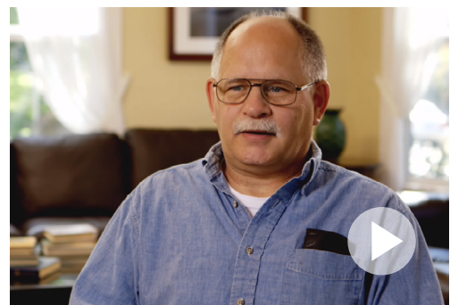
Becoming sober turned his life around

Link 2: https://maketheconnection.net/conditions/problems-with-drugs