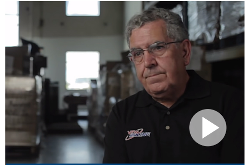
The path to recovering from PTSD

Link: https://maketheconnection.net/conditions/ptsd