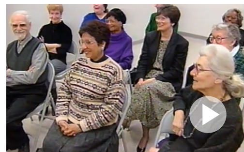
Alcohol and medication among older adults

Link 2: https://www.youtube.com/watch?v=FQan4-6amJk