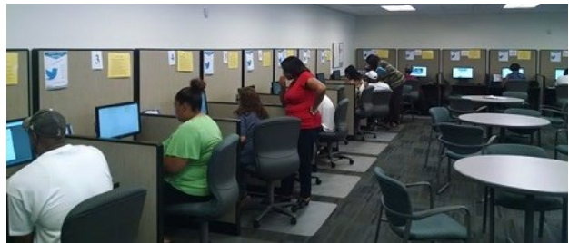
AJC Resource Rooms are available and equipped with computers, fax machines, and printers for job related functions for job seekers to utilize during their job search. AJC Staff are available to assist.

Under this current model, we have hosted about 18 hiring employers and over 250 job seekers on site for one event! This allows employers have great flexibility in searching for qualified workers, and job applicants have easy, efficient access to job openings.