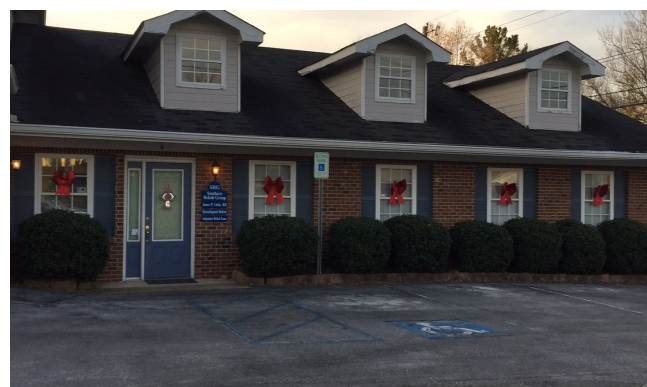
Southern Rehab Group 1011 Spring Creek Road, Chattanooga TN 37412