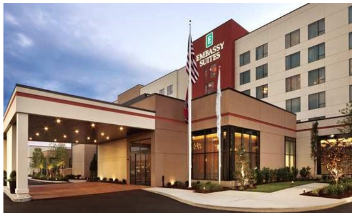
The Embassy Suites Knoxville/West 9621 Parkside Drive, Knoxville TN 37922 856-246-2309

The Embassy Suites, Knoxville/West. A block of rooms has been reserved at the conference hotel at the rate of $129, single king loft. The rooms will be held through May 11, 2016, unless this block becomes fully reserved prior to this date. Register early! Call (865) 246-2309 or (800) 774-1500. Indicate you are attending the Tennessee Workers' Compensation Physicians Conference and give the code IWC when making your reservations.