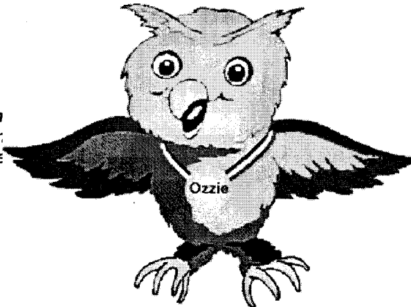
Ozzie the Ozone Owl

Local government, industry, academia, and the medical community. Working together as a region and by voluntarily taking certain steps, we can make a difference in our air quality.