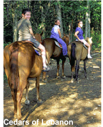
Cedars of Lebanon

For more information call: 423-323-8543.