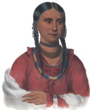
Print of a Native-American woman from McKenney-Hall, circa 1836

The Tennessee State Library and Archives is located at 403 Seventh Avenue North in downtown Nashville, Tennessee. TSLA is open Monday through Saturday from 8:00 am to 6:00 pm CST, excluding state and federal holidays.