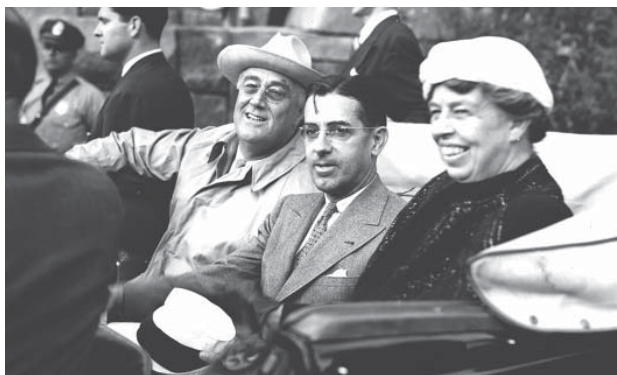
The Roosevelts and Governor Cooper at the Smoky Mountains National Park dedication, 1940

Some items will be available in their entirety, whereas others are only indexed and require an on-site visit to examine. Some of our materials are available on microfilm only and can be accessed during a visit to TSLA or through inter-library loan arranged by your local library.