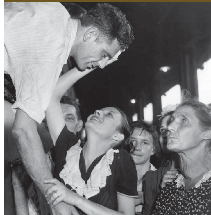
Recruits leaving Union Station, 1942

with primary sources from the Tennessee State Library and Archives