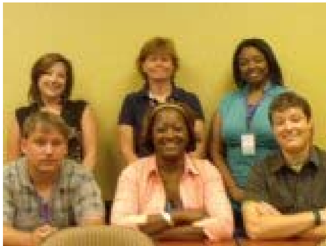
BRADLEY COUNTY JUVENILE JUSTICE CQI TEAM AUGUST 2009