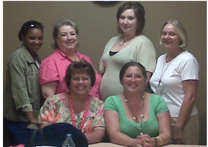
SOUTHEAST REGION PLACEMENT SPECIALIST CQI TEAM AUGUST 2009