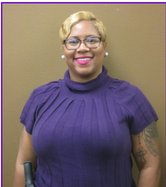
TDOD D40 Nashville Office