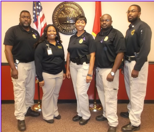
TDOC D60 Jackson Office Staff