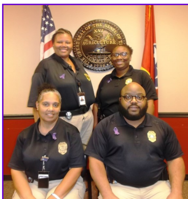
TDOD D60 Jackson Office Staff