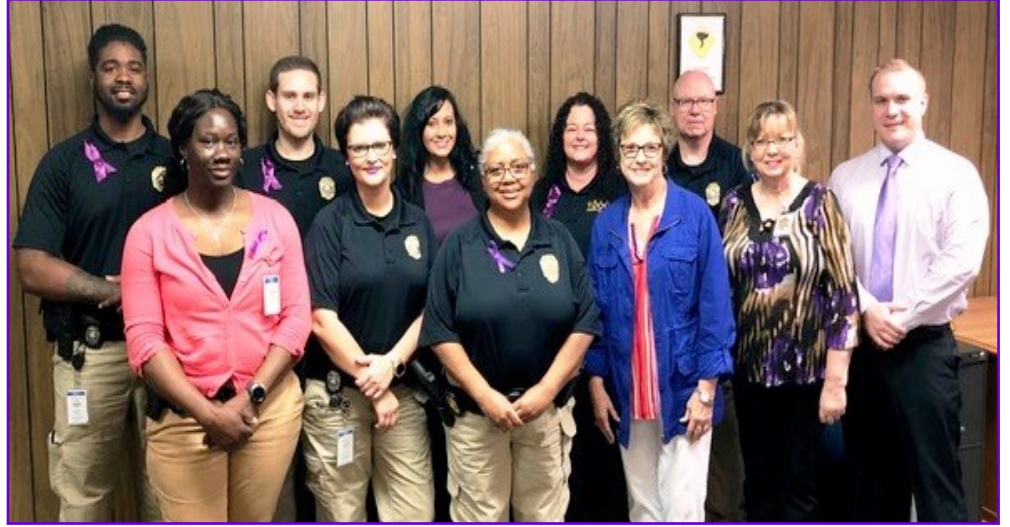
TDOC D61 Dresden Office Staff