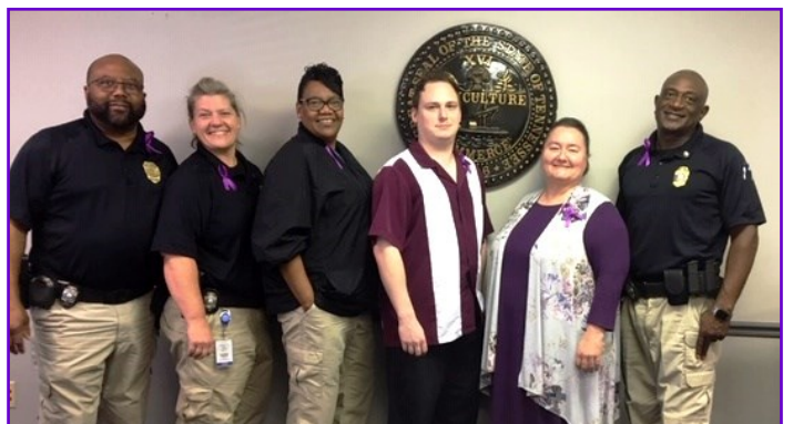
TDOD D61 Dyersburg Office Staff