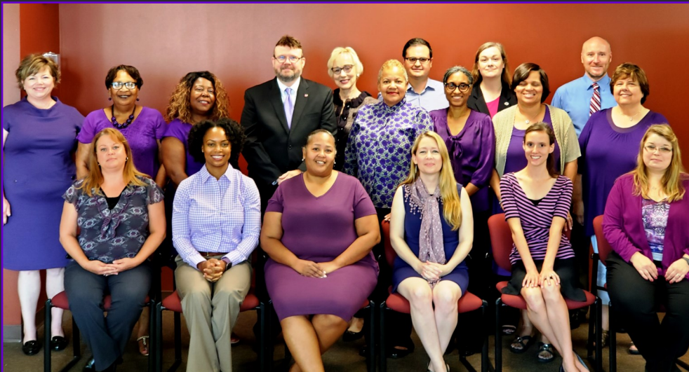
TBOP Central Office Staff

Serving Crime Victims of Tennessee since 1993