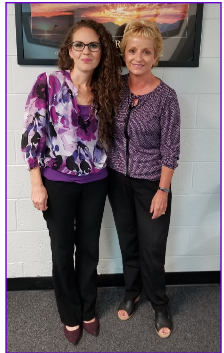
East Tennessee Hearing Officers Greenville and Johnson City Offices