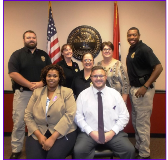
TDOD D60 Jackson Office Staff