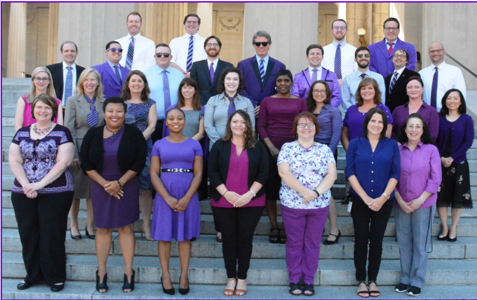
TN Attorney General's Criminal Justice Section Office Staff