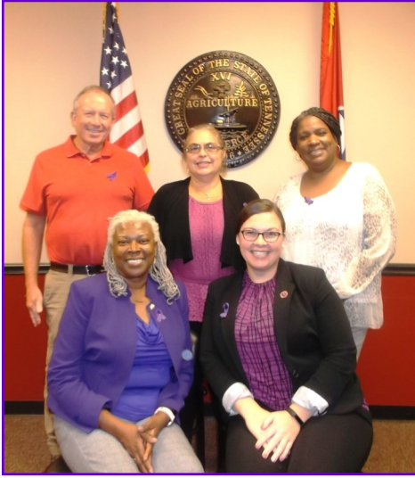
TDOC D60 Jackson Office Staff