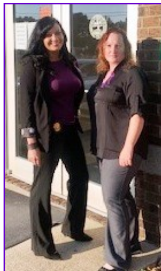
TDOC D61 Lexington Office Staff