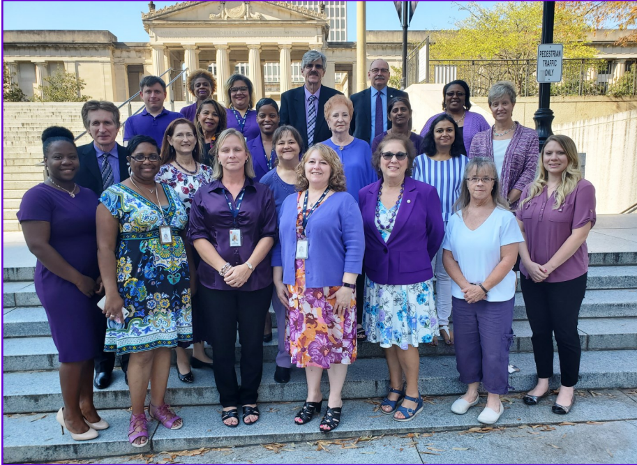
TDOD Nashville Central Office Staff