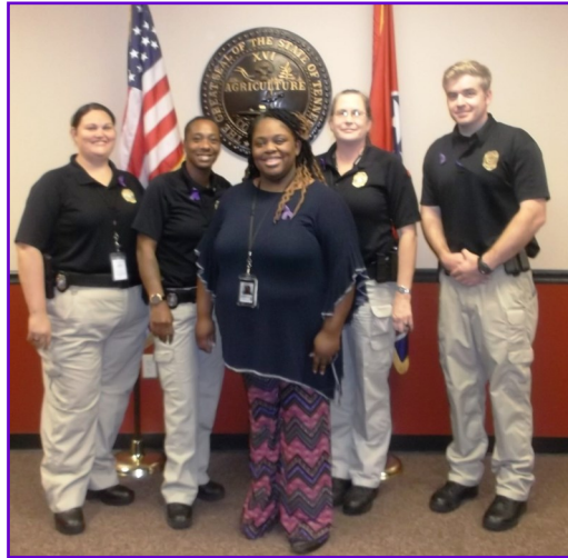
TDOC D60 Jackson Office Staff