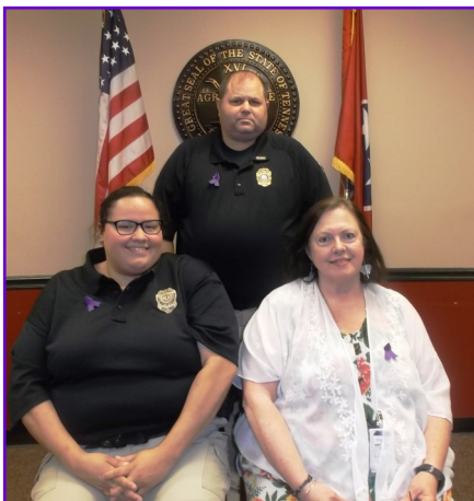
TDOC D60 Jackson Office Staff