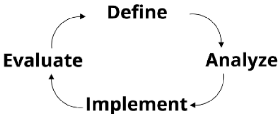
Illustration of the cyclical nature of data-based decision-making