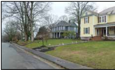
Tennessee Military Institute Residential Historic District

his own residence adjacent so that he could supervise construction and administration of the school. Other school leaders' residences were also built nearby, as well as a hospital. Military exercises took place on the street, supervised by school leaders from the front porches of their residences. The three remaining residential buildings that encompass the district exemplify the Queen Anne and Craftsman styles. Tennessee Military Institute Residential Historic District