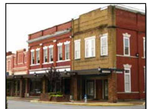
Elizabethton Downtown Historic District

existed from 1784 to 1788. Elizabethton includes many National Register-listed sites included the Ruben Brooks Farmstead, the John and Landon Carter House, the Renfro-Allen Farm, a U.S. Post Office, the Watauga Hydroelectric Project, and the Elizabethton Historic District. The city is also home to the Sabine Hill State Historic Site and the Sycamore Shoals State Historic Area. Prior to formally becoming a CLG, city staff and historic zoning commission members from Elizabethton have been regular attendees at trainings and workshops hosted by the Tennessee Historical Commission. All local governments with active historic zoning commissions are eligible to receive certification.