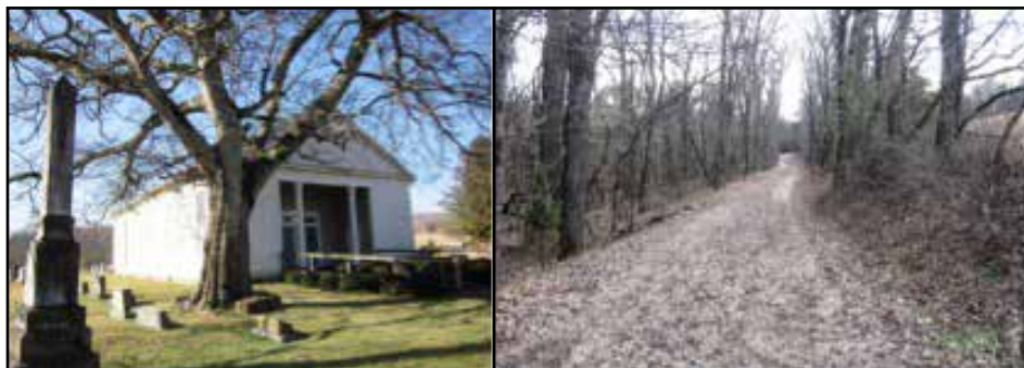
Bedford County Thompson Creek Rural Historic District

This project is representative of the consultation process when there is an adverse effect to a historic resource. This process successfully involved the SHPO, the federal agency funding the undertaking, the state agency acting on behalf of the federal agency, and public participation throughout the consultation process to best mitigate the adverse effect. The Section 106 process works best when all parties involved work together to work towards the best possible outcome for any situation. This undertaking also highlights how Section 106 works with other federal programs in the SHPO. In this case, the mitigation for the undertaking was a National Register nomination and multiple property documentation form. Mitigation can also take the form of survey, and Section 106 projects sometimes overlap with federal tax credit projects.