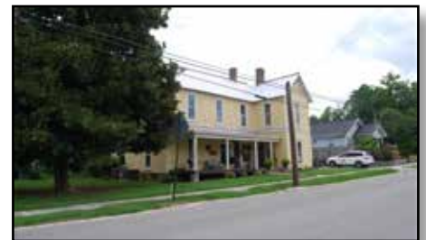
Sparta Residential Historic District

The nomination was prepared by Carver Moore of Moore Historical Consulting.