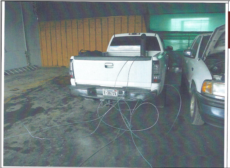
Cable entangled in pick-up bumper