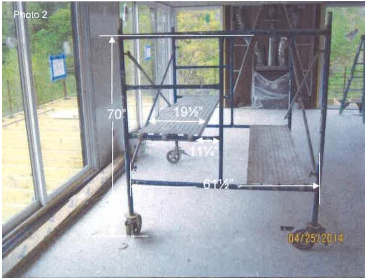
Photo 2 of 2 – Gadsen mobile frame scaffold. The victim was working on the 2 nd level