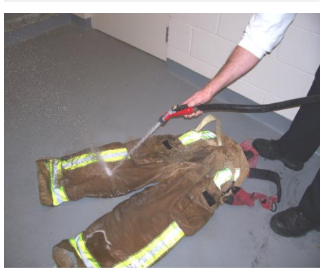
Step 5: Thoroughly rinse gear with clean water.