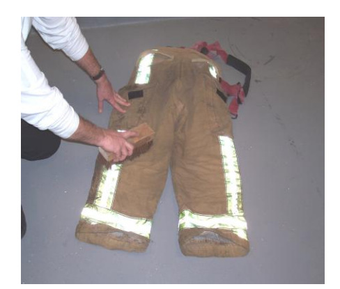
Step 1: Brush any loose dirt and debris from gear using a stiff bristle brush.