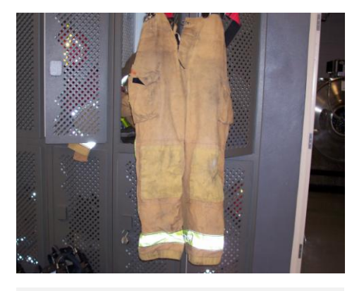
Step 6: Hang to dry in a well ventilated area. Do not hang in direct sunlight.