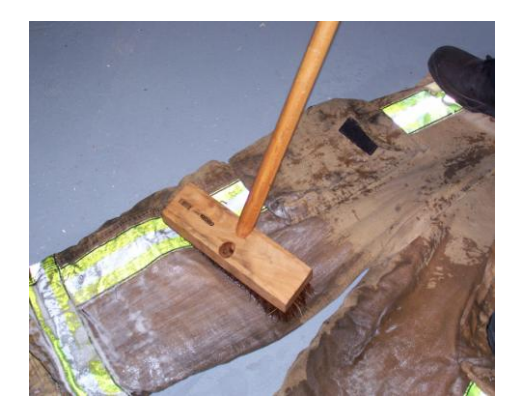
Step 3: Brush gear with stiff bristle brush and wash solution.