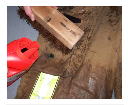
Step 4: Spots and stains can be treated by applying a small amount of Tide directly to spot and scrubbing.