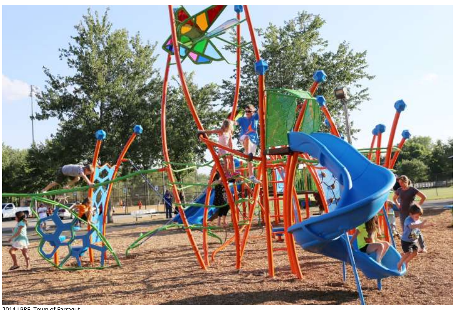
2014 LPRF, Town of Farragut