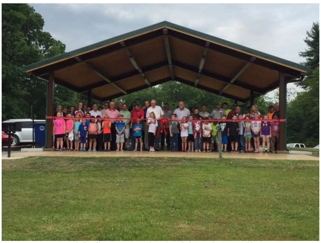
2014 LPRF – Shelbyville Never Rest Park Pavilion Shelter Replacement Ribbon Cutting

The LPRF projects in Middle Tennessee were very diverse with emphasis on new park development and the renovation of older obsolete parks and facilities into new uses to serve the growing communities. An example of a community being dedicated to improving existing facilities with a renovation allows a popular aged facility in a recreation system to be revitalized and meet current regulations and compliances.