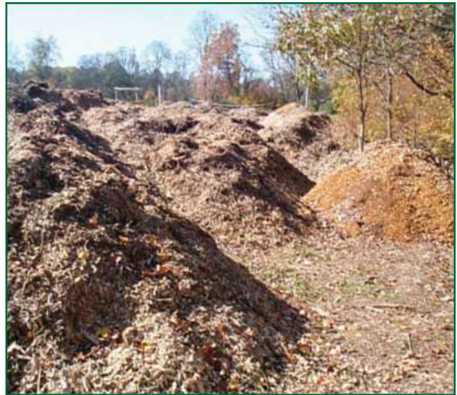
Free wood chips