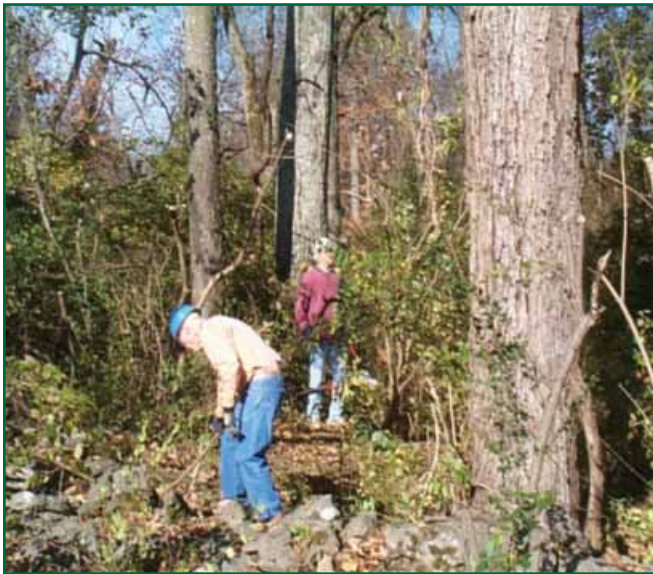
Building the trail using hand tools

In 2009, the Christ Community Church in Franklin had the idea to create a walking trail around a large portion of the church campus. They were able to get all the wood chips they wanted for free from several local tree companies who were more than glad to get rid of the chips instead of having to make a long trip to the landfill. Several of the Garden Board members worked together to arrange a “trail work day” in which people came together on a Saturday and began to clear the brush necessary to create a walking path. The church property borders the Harpeth River, so there is a portion of the trail meandering along the river with the rest of the trail around the periphery of a large field and community garde. The walking trail extends from Hillsboro road along the river all the way to the back of the property, and then makes a loop around the field. It’s about a mile (5,280 feet) in length. It is now beginning to be used by people in the community as well as church members. Currently, the trail project is under the church Garden Board. Attached below are a few pictures of the project.