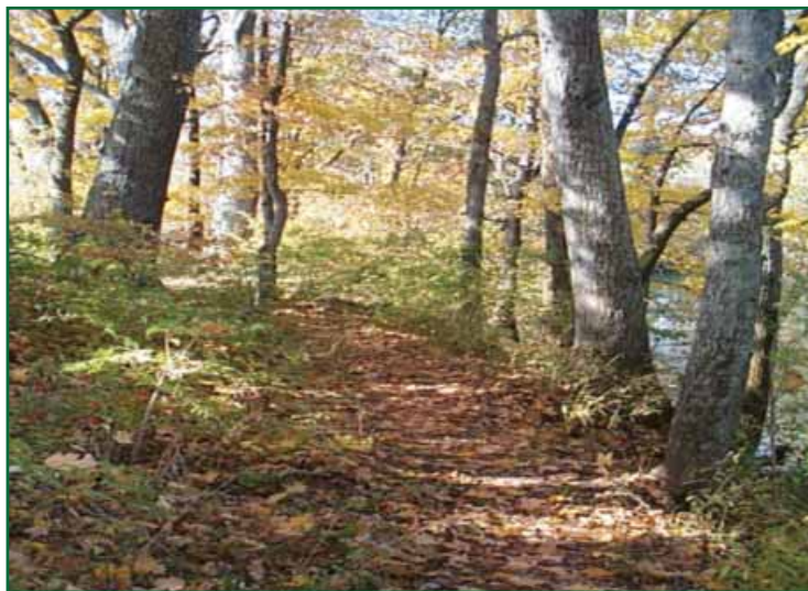
Finished trail at Christ Community Church in Franklin, TN