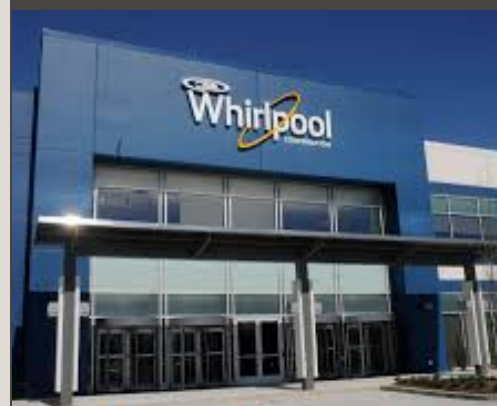
The front of Cleveland's LEED Gold Whirlpool facility.