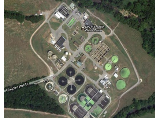
Franklin Water Reclamation Plant

the Franklin Water Reclamation Facility, (WRF) a 12.0 million gallons per day (mgd) design flow oxidation ditch wastewater treatment system that serves the City. The average daily flow is approximately 10 mgd, and the plant provides high level treatment - monthly CBOD limit of 4 mg/l summer, 10 mg/l winter and monthly total nitrogen limit of 5 mg/l in the summer. The WRF effluent is reused for irrigation within the City and discharged to